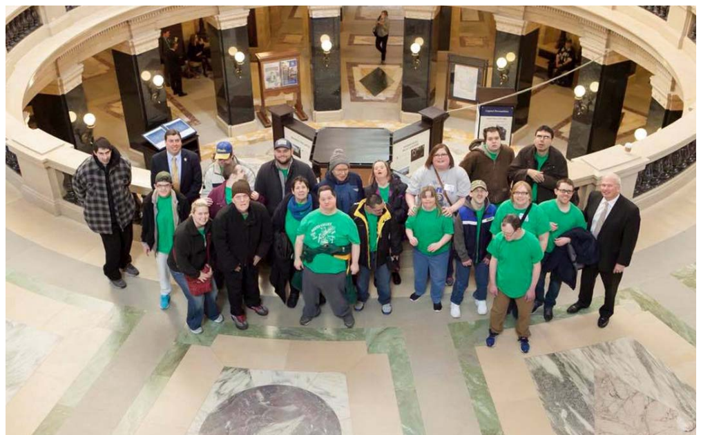
A trip to the State Capital

When the weather turns nice we venture farther afield and take in museums, local events and seasonal attractions and some of our favorite annual events include the Dodge County Fair, Henry Vilas Zoo, a summer baseball game and a tour of the Capitol in Madison. This event is actually on tap for March 8th and is much anticipated (it includes a stop at the food court at EastTowne Mall, yum yum) by clients and staff alike. The staff at the rotunda is wonderful and take us on a guided tour of the building, pointing out interesting and historical features, telling us what takes place, who works there and answering any questions we might have. It is an exciting adventure, just one of many to be had in SNAP!