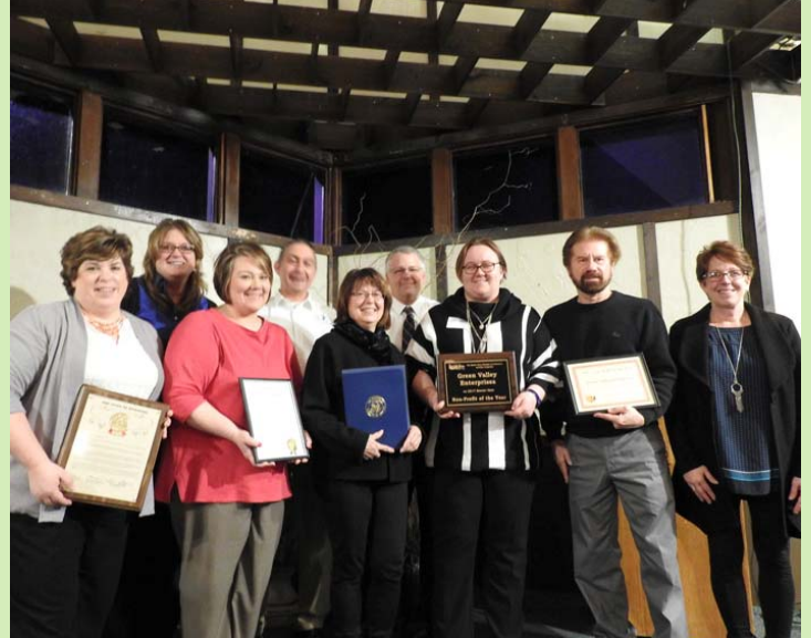
Accepting the Non-Profit of the Year Award on behalf of Green Valley Enterprises

Guardians of GVE participants who are in production will be receiving a letter in mid March. This letter will explain that UW Whitewater will be conducting Career Counseling and your permission is needed for your participant to attend. It will be very important to sign and return the documents you will receive. New WIOA regulations will not allow participants to work in our production floor without career counseling.